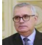
Vladimir Knyginin Vice Governor of Saint-Petersburg Being agreed