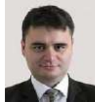
Vasily Osmakov Deputy Minister of the Ministry of Trade and Industry of the Russian Federation Being agreed